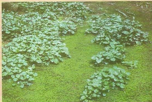
Fern Moss & Shortia