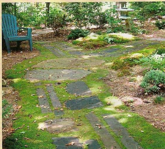
Fern Moss (“Thuidium”) & Flagstone Path

spring and fall seasons. Prior to transplanting, moss should be stored in a cool, dry place.