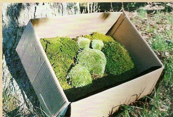
Moss “Sampler Set”

in smaller quantities as they are much slower growing “clump” type mosses. These are used primarily to provide color, height, and texture variation in the “moss landscape”. All four varieties are shade-loving, but will handle some dappled sun. Customers nationwide are having outstanding transplant success even in warmer southern and western climates, provided shade